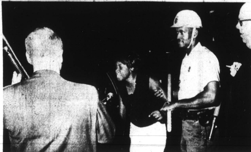
UNDER ARREST —(Montgomery, Ala.)—Montgomery Police place one Negro under arrest here when a group that was marching without a permit were told to go home, then several Negroes rushed the police lines and the arrest started.