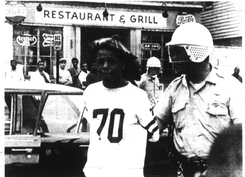
YOUTH ARRESTED —(Buffalo, N. Y.)—A Buffalo youth is led away after he was arrested by police during the second night of violence in this city. At least five persons were shot and wounded this second day while about 30 were arrested.