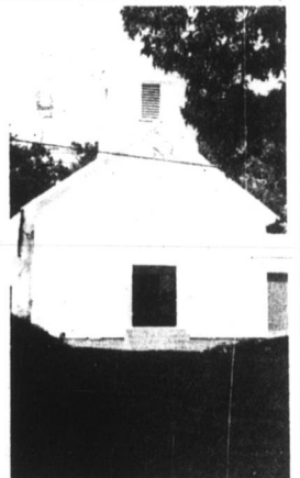
MOTHER CHURCH Shady Grove Free Will Baptist Church 1867-1967