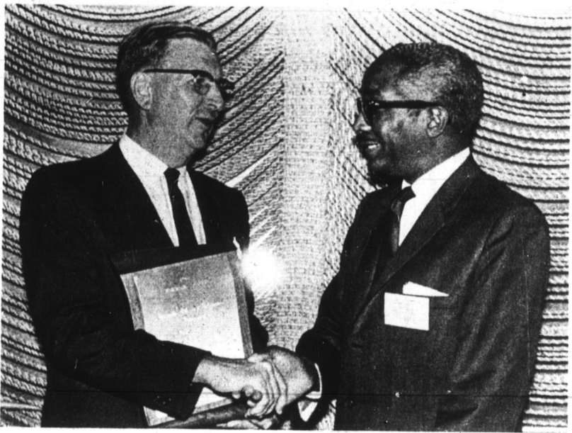
AWARD TO HUMBLE OIL — Two years ago, Humble Oil & Refining Company spokesman told members of the National Association of Market Developers at a meeting in Houston, Texas, that commendable policies and well-intentioned words from business and industry are not enough but, must be accompanied by equally positive actions—if companies intend to meet their obligations as good corporate citizens and help solve today's urgent social problems. In short, he said, it will be the companies that pro-

vide expanding opportunities for minority employment, training programs that will lead to needed skills, and aid to education and community-betterment undertakings, that will deservedly gain both in corporate image and sales. At NAMD's recent national convention, with its members again meeting in Houston, the organization's annual award to a company setting an example for others was presented to Humble Oil, for translating its stated policies into action, both before and after the 1965 declaration. How-