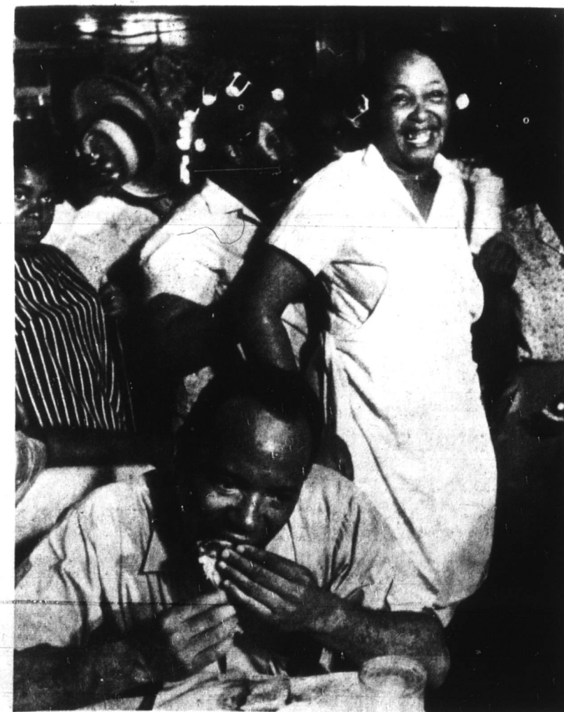
CHOW TIME! —Coldwater, Mississippi — James H. Meredith eats fried chicken as he takes lunch break during his "march against fear," here. Meredith then set out again to complete his march through Mississippi.

WASHINGTON, D. C.—Does anyone ever die of just plain old age? If all diseases were curable, and no one was killed in accidents, how long would we live? Is there some point at which the body would wear out and simply give up? Would such wearing out take place at age 100, 150, 200? Scientists trying to answer these questions first have to define aging. In the absence of disease, what changes take place as the individual gets older? The next question is, what causes these changes? And the ultimate question: Can anything prevent or delay these changes? The National Society for Medical Research points out that laboratory animals, always important in scientific research, are indispensable in the study of aging. The animals' diet and other environmental factors can be controlled, but most important, the researcher will outlive his experimental subjects. The relatively short life-span of most animals permits birth-to-death developmental studies which are not feasible in humans. Such animal studies have indicated several possible explanations for the aging process: We may eat ourselves to death; something causes body cells to release substances which di-