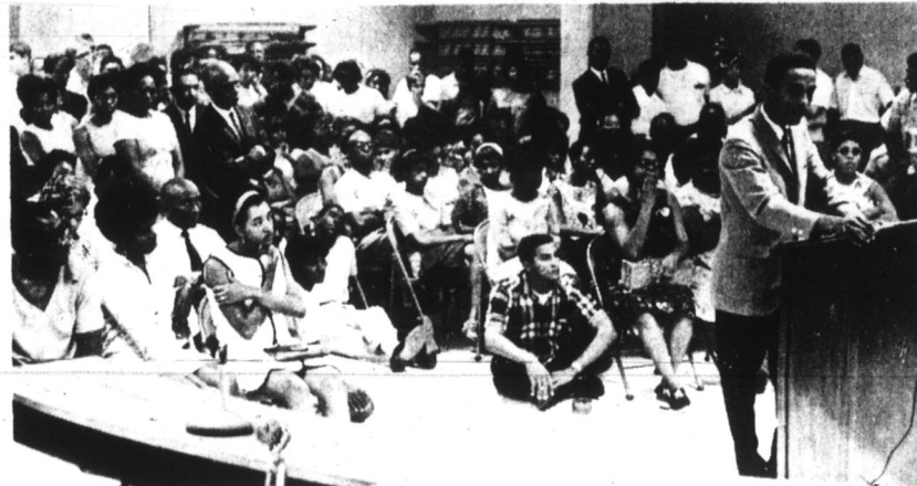
Hampton Addresses City Council