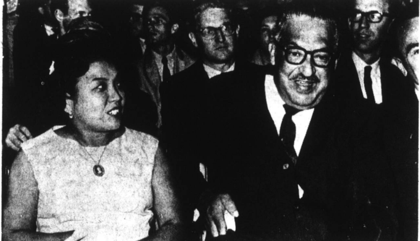
NEW JUDGE AND WIFE — (Washington)—Thurgood Marshall, the first Negro nominated to the Supreme Court, faces Senate Judiciary Committee examination on his attitudes toward the court's increasingly liberal rulings on criminal justice and civil rights. Marshall is shown here with his wife as he waits to take the witness stand.

WASHINGTON, D. C.—Senator Walter F. Mondale (D-Minn.) this week introduced two major housing proposals designed to better the living conditions of millions of low and moderate income families. One of the bills—the Home Purchase Assistant Act—is designed to conserve existing housing and increase home ownership opportunities by making low-interest mortgage credit available to lower income families. The other proposal—the Housing Expert and Loan Program (HELP)—is designed to help non-profit groups sponsor multi-unit housing projects for lower income families and the elderly under existing programs.