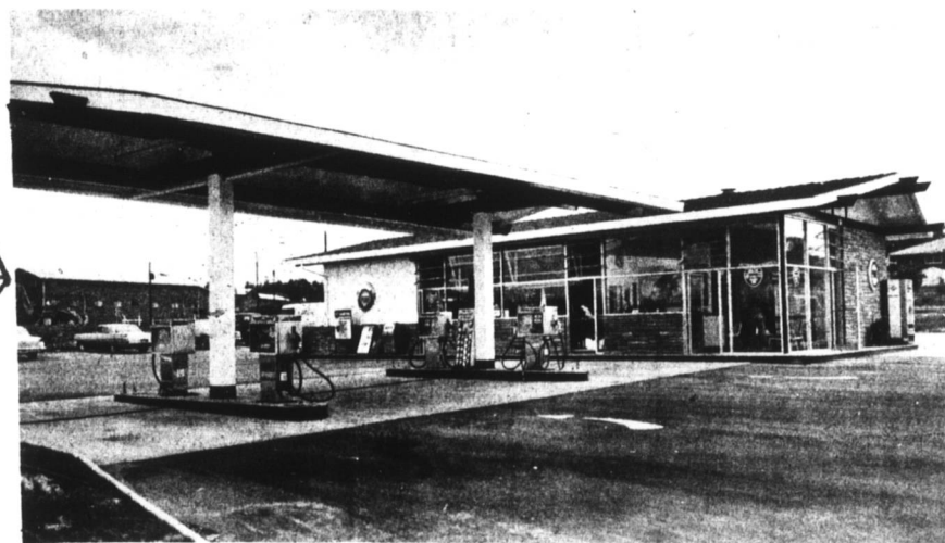
403 PILOT STREET

Free PHONO RECORDS TO EACH CAR WHILE THEY LAST