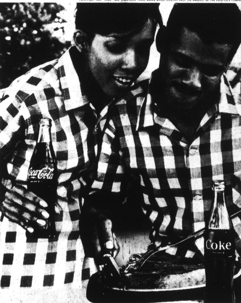
You'll go better refreshed with ice-cold Coca-Cola. Coke has the taste you never get tired of. Always refreshing. That's why things go better with Coke after Coke after Coke.