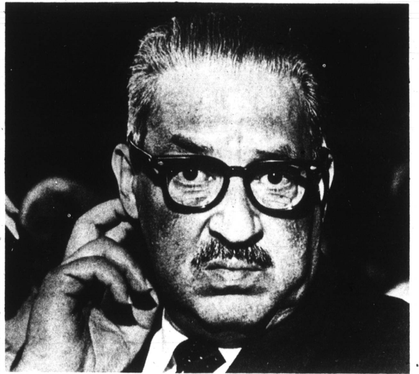
APPEARS BEFORE SENATE JUDICIARY COMMITTEE —

(Washington)—Thurgood Marshall shall appear before the Senate