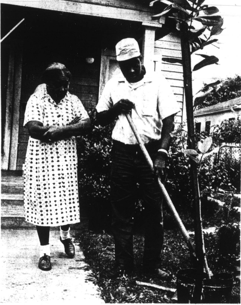
NO RIOTS, JUST SELF-HELP —(Los Angeles, Calif.)—This year near the scene of the 1965 Watts riots there wasn't any damaging rampages, but instead a "Paint-In, Plant-In" demonstration. It was the kick off of a major community improvement program or self-help project of

Home - Opportunities-Progress - Etcetera" (H.O.P.E.). Here, a mother watches as her son plants one of the 100 trees delivered to residents of the area to help them improve their property. The plan has a special incentive for the residents, which is a