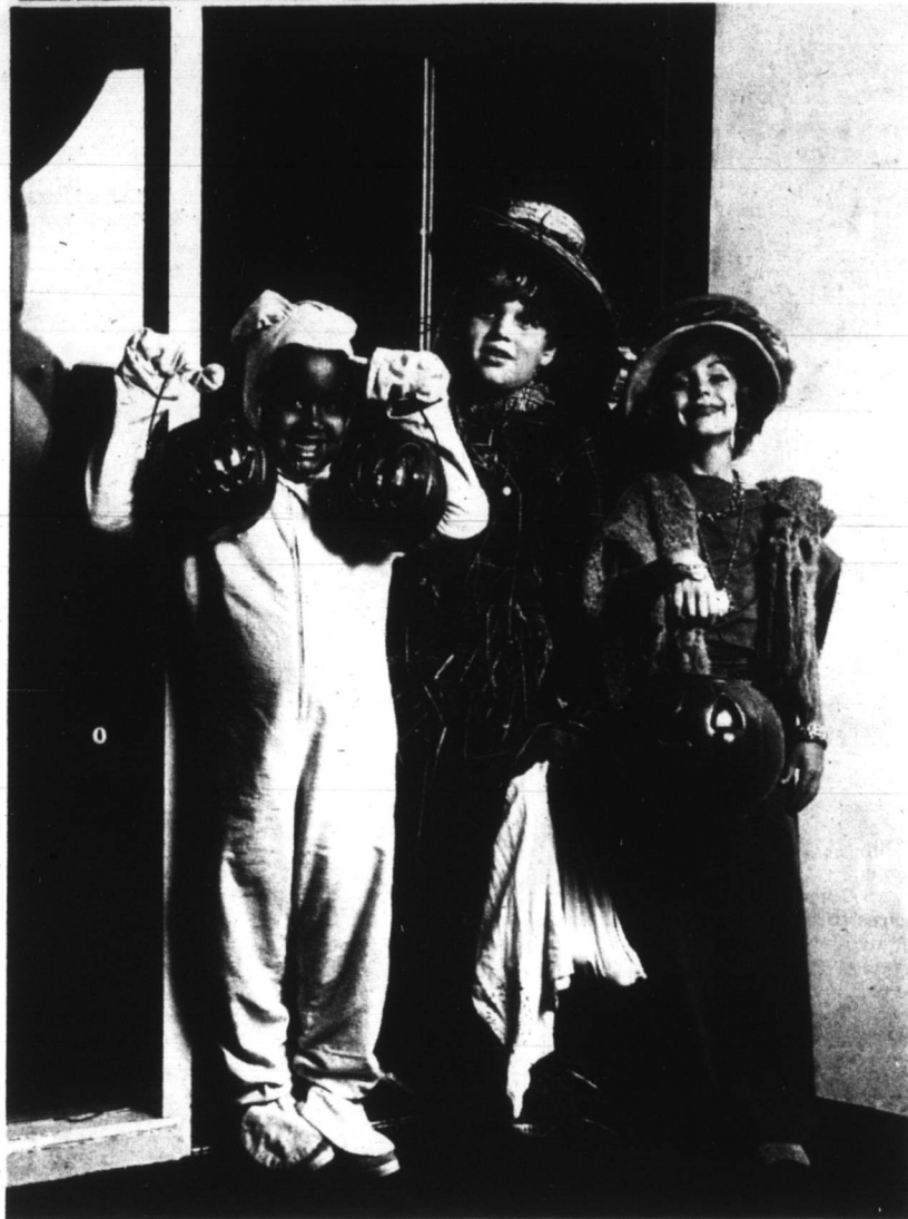
FEARSOME FOURSOME —Halloween presents exceptional opportunity for appealing pictures of youngsters. In this photo, note that camera level is adjusted to small fry height—well below the adult's eye to avoid distortion.