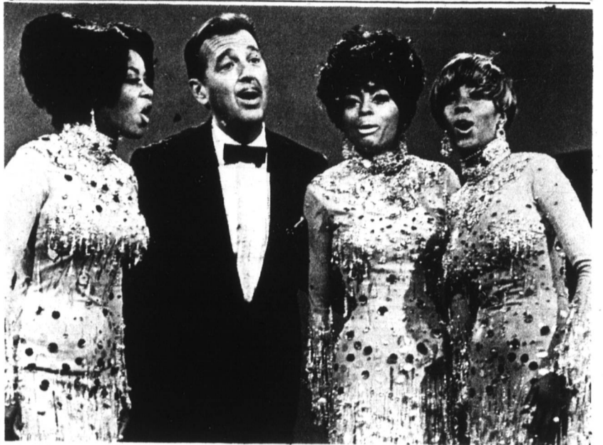
HARMONIZING — Supremes Cindy Birdsong, Diana Ross and Mary Wilson are caught harmonizing with Ernie Ford during rehearsal for "The Tennessee Ernie Ford Special," to air Dec. 3 on CBS-TV.

The win gave A&T a final season record of 3-5-1. North Carolina ended play with a 1-7-1 record.