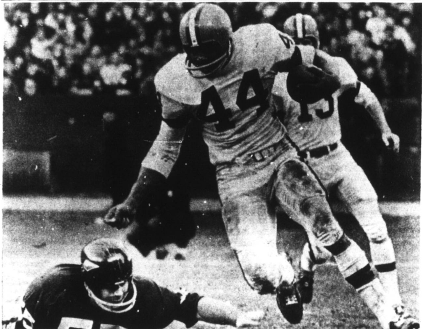
KEEPS RUNNING —(Cleveland)—Cleveland Browns' back Leroy Kelly jumps around Washington Redskins' Chris Hamburger (bottom) and is off and running during a pro football game at Cleveland November 26th. Kelly gained 163 yards in 20 carries and scored two touchdowns as the Browns won, 42-37. He thus joined the league's "1,000 Yard Club" for the second season in a row and continued to lead all National Football League rushers.