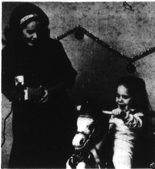
Kodak Instamatic movie camera

All an outsider can say is that now is the time to visit Paradise—Bali, the Isle of the Gods.