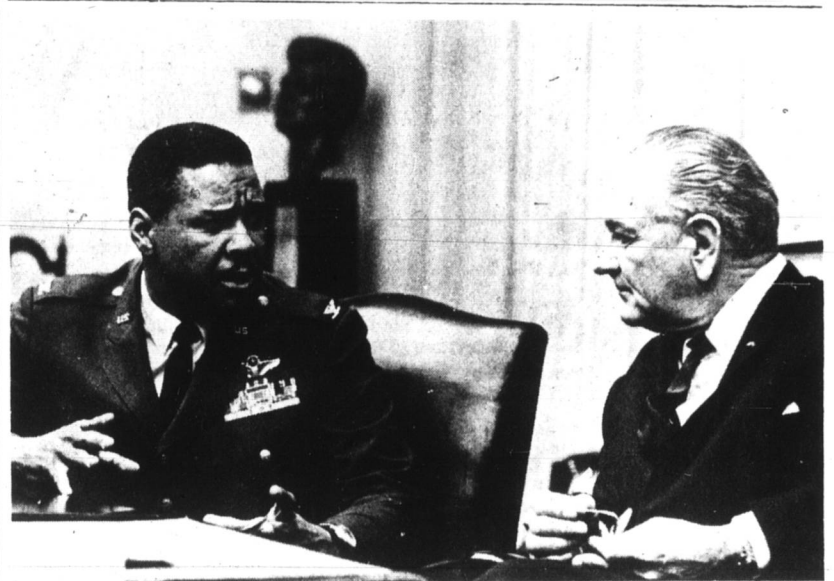
LBJ BRIEFED—President Lyndon B. Johnson is briefed on U.S. air operations over North Vietnam by Colonel Daniel James, Jr., U.S. Air Force, who has just returned to this country after having flown 76 combat missions against the Communists. Colonel James, who was based in Thailand during his tour in Southeast Asia, will become Vice Commander of the 33rd Tactical Fighter Wing, Elgin Air Force Base, Florida.