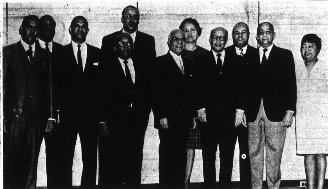
69TH ANNUAL POLICYHOLDERS' MEETING PARTICIPANTS —Participants in the 69th annual North Carolina Mutual Life Insurance Company Policyholders' Meeting