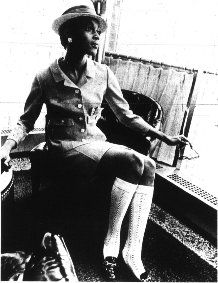
SUITED FOR SPRING —The biggest news from Paris is that suits are back—a wonderful piece of news for women who have always loved the good looks and comfort of this easy way of dressing. Davidow fashions an easy-fit town suit of Irish linen and buttons it in

brass. Flap pockets decorate the front of the jacket. A boldly printed Irish linen handkerchief spills out of one pocket. The balancer to this new fashion look is the rightness of knee-high socks for city wear on the elegant women this year.