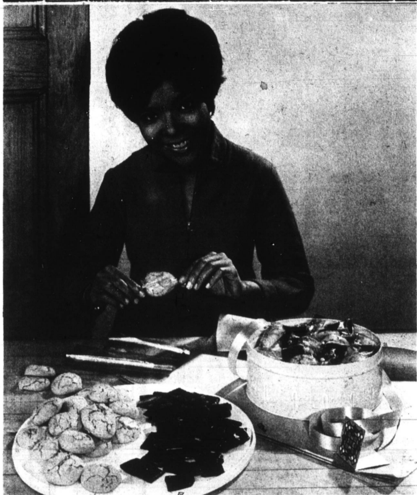
LET'S GIVE AGAIN!—(Coffee Brittle) (Coffee Cashew Kisses) —Every season is the time to make and give an assortment

of homemade candies and cookies. Coffee Brittle and Coffee Cashew Kisses, both flavored