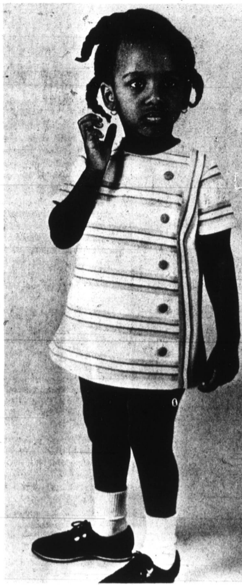
CLASSICALLY TAILORED, bonded orlon A-line dress with deep pink and light green horizontal stripes in front and back — set off with vertical stripes on the side . . . dramatized by self-covered green buttons. By Nannette

When something has to be done, we usually find a way to do it.