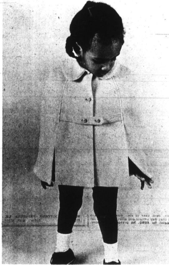
HOW SMART CAN A LITTLE GIRL BE? Here is a very smart one in a cape and dress by Nannette. The cape of textured bonded orlon has front slashes for little arms to peep through. Under it, a matching A-line bonded orlon stripe dress with a double chain belt. By Nannette.