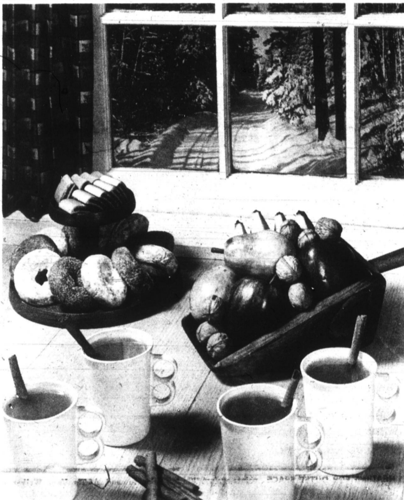
SO LET THE WIND BLOW!—(Hot Cider Punch) — Nothing will warm family or friends as delightfully as Hot Cider Punch. A winning combination of spices, apple cider, and instant breakfast drink.