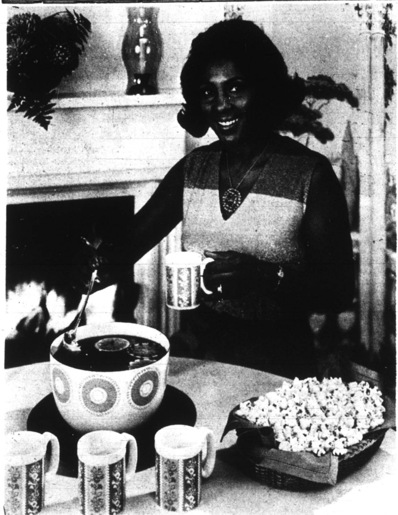
WARM THE PUNCH BOWL FOR A CHANGE! —(Mulled Cranberry Punch)—For a great change of pace idea in the drink department, serve warm

and spicy Mulled Cranberry Punch at your next at-home gathering. Cranberry juice and Kool-Aid Instant Soft Drink Mix provide a delicious fruit-