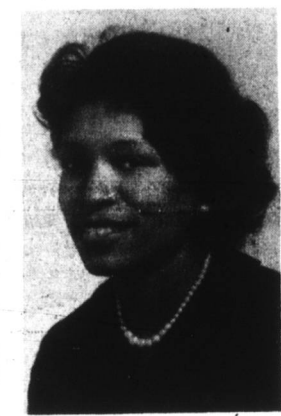
MRS. CLAYTON aid low income Americans in the areas of jobs, housing and education. The bill also has strong anti-discrimination laws and enforcement provisions. See MRS. CLAYTON 8A

He was sponsor of the Full Opportunity Act which would provide $30 billion yearly to