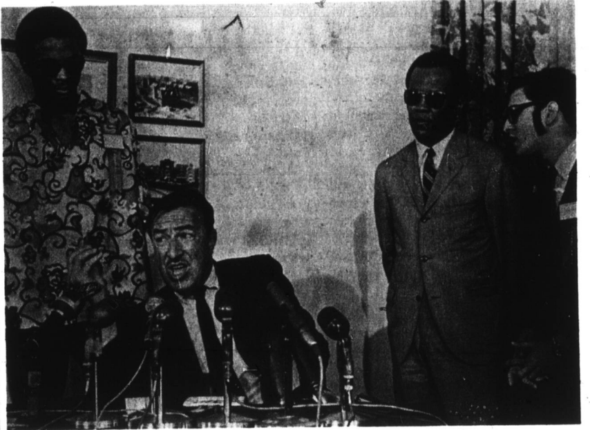
DEPOSED NEW YORK CONGRESSMAN Adam Clayton Powell is shown answering a newsman's question during a press conference Monday, April 1 at Duke University where he was scheduled to address the student body. Powell was later hospitalized after complaining of chest pains and being tired. Doctors at Duke Hospital said that Powell was suffering from "exhaustion." Others in the picture are unidentified.