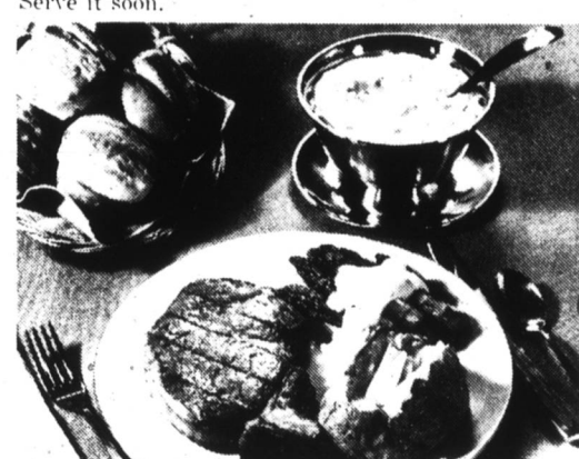
RICH ALMOND SAUCE (Makes about 115 cups)

Make a special dinner even more special - serve Rich Almond Sauce over asparagus or broccoli spears. The home economists at Carnation Company recommend sauce because it is so creamy and lump-free. You will like the gourmet touch it adds to your menu.