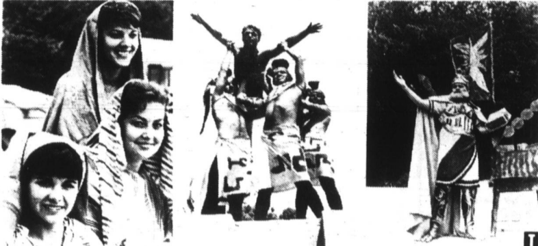
The cast in colorful costume bring biblical history to life again.