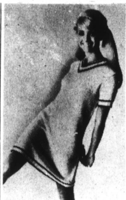
"Raequet Club" dress by Alberdy is of cold-washable Orlon knit in white with navy trim.

This summer the frost is on the papaya! The lush, tropical look of '68 summer fashions is a cool wash of white. Designers have put white at the top of the list for everything from swimsuits to evening gowns.