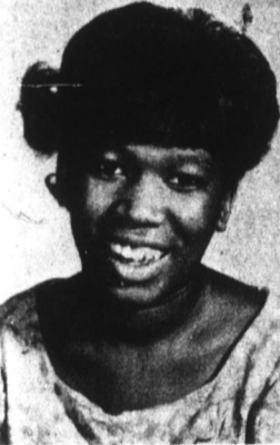
Orange High School is lively and active once again, after

a long summer of peace and quiet. The doors opened this year to approximately 1,000 students, both black and white. The combined faculty of both Central and Orange makes the educational opportunities exceptionally high this year. Mobile units provide additional classroom space for the large student body. The student parking area was increased also for extra bus space.