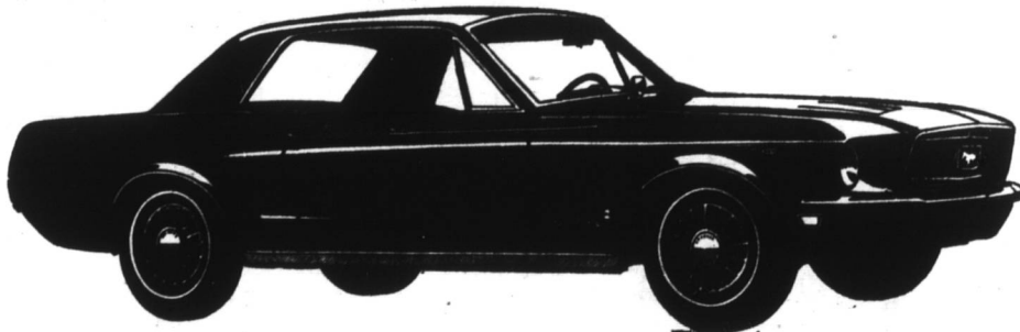
NEW 1968 MUSTANG 2-DR. HARDTOP

It's General Knowledge This Warranty Will Never Prevail Again in The Automotive Industry!