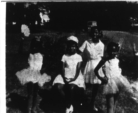
PARTICIPANTS in the program presented recently by the Pearisontown Community Club No. 1. They are, left to right:

Most of the Soviet Union's vast territory lies farther north than the 48 contiguous United States.