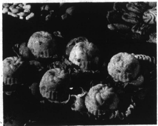
ORANGE SALAD SNACKS (Makes 6 servings)

Prepare yourself for the holiday hustle and bustle that starts with Thanksgiving weekend. Do-ahead Orange Salad Snacks add a tangy touch to dinner. Served with cookies, nuts and mints, they're an easy luncheon when friends drop in to catch up on school chatter or share Christmas secrets.