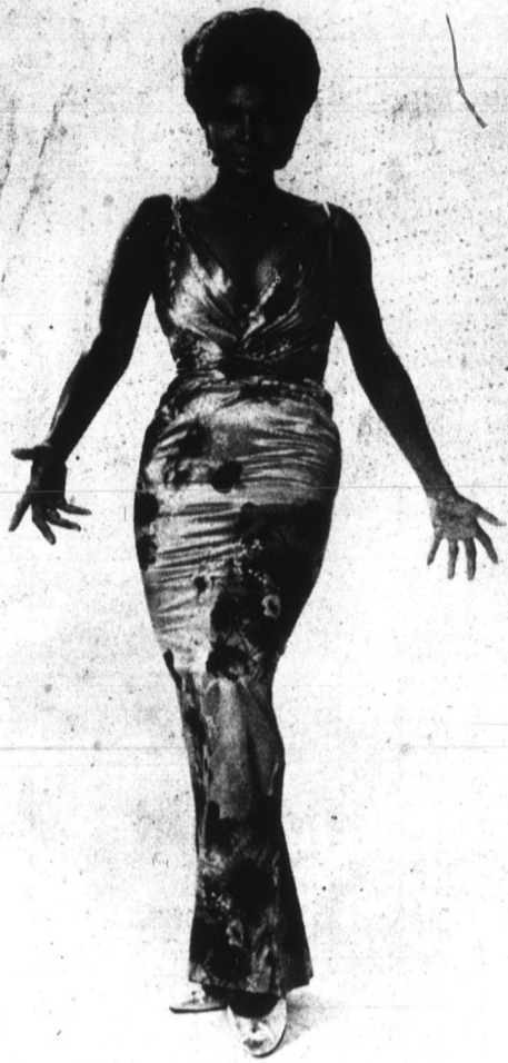
TORCH SINGER — Nichelle Nichols, a torch singer, finds singing and acting compatible, as she plans to re-emerge as a vocalist while continuing as Uhura, the communications officer, on "Star Trek" over the NBC Television Network Friday.