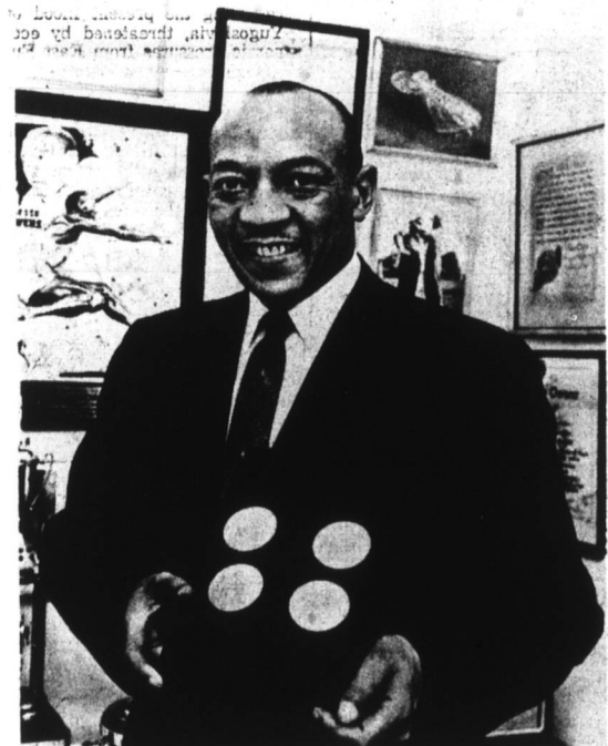
TO LEAD TEACHING CLINICS—Jesse Owens, former Olympic track great, will lead a series of teaching clinics to Central

After a period of joblessness his family and friends persuaded him to join Job Corps. He was at a Job Corps Center in Oregon from August 1965 to February 1966, when he was transferred to Parks Job Corps Center at Pleasanton, California. There he was encouraged to join the boxing team, was elected president of his dormitory, and was trained in drafting. He completed his Job Corps training in May, 1967. Since September 1967