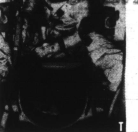
U. S. astronaut John W. Young, wearing pressurized suit, is shown in the Apollo Mission Simulator. Partially visible in the photo are astronauts Thomas P. Stafford, left, and Eugene A. Cernan, right.

More than 1,000 possible malfunctions also are programmed to forewarn and teach astronauts about potential difficulties.