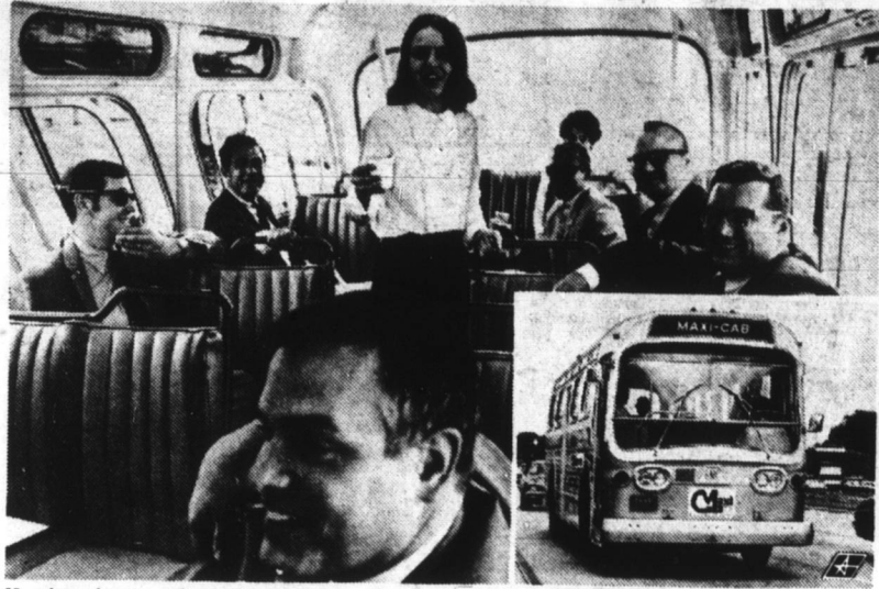
Happiness is commuting in Maxi-cabs, an urban transportation experiment offering deluxe bus service.

FLINT, MICH.—Replacing the words "mother-in-law" and "Brooklyn" as an automatic laugh-getter is "commuter."