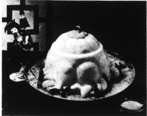
BANANA-ORANGE DESSERT MOLD (Makes 6 to 8 servings)

Delight guests with a light, refreshing dessert. Banana-Orange Dessert Mold is the perfect ending for a tasty meal. Evaporated milk keeps it creamy-good. Garnished with mint leaves and orange segments, the mold looks as good as it tastes.