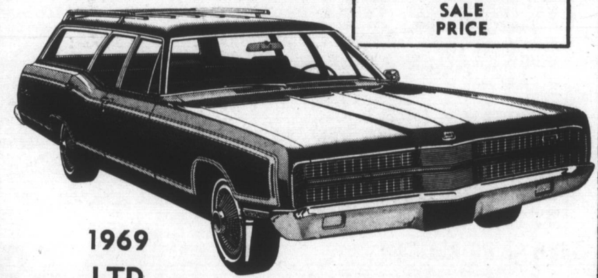
1969 LTD COUNTRY SQUIRE

Window Sticker Price $6366.00 $4779.00 SALE PRICE