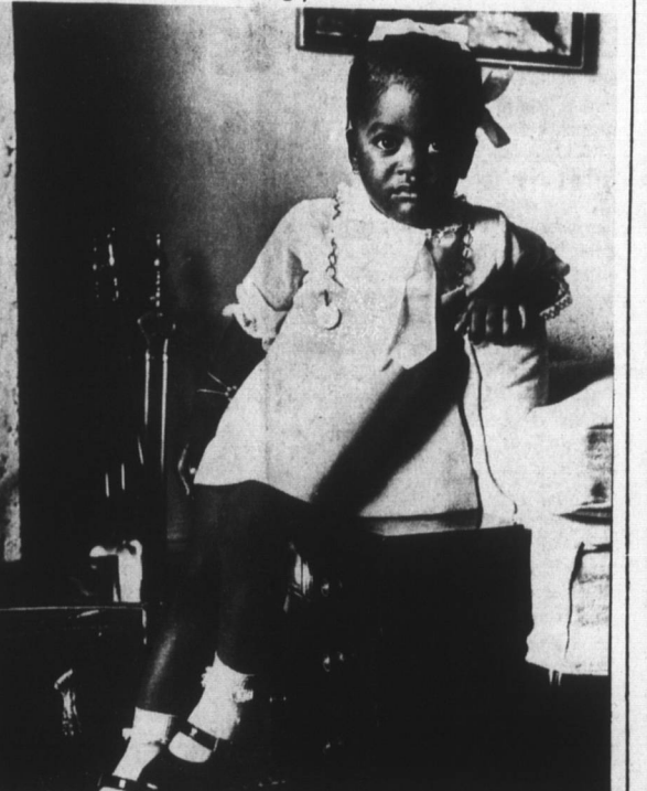
BRIGHT GOLD BONDED ORLON skirt has novel chain suspenders held with coins in button holes. Attached white dacron and cotton voile blouse has lace edging around collar and wrist length sleeves.