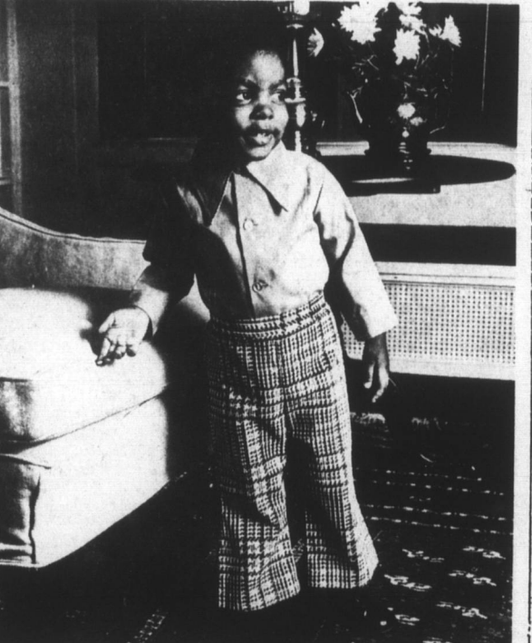
THE LONG COLLAR is "in" for little boys. The dacron and cotton gold shirt is coordinated with patterned gold and oxford gray on white corduroy trousers. Two rows of stitching march down the front of the shirt.