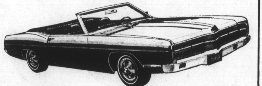
1969 FORD XL CONVERTIBLE

BRAND NEW 1969 FALCONS As Low As $1979.00