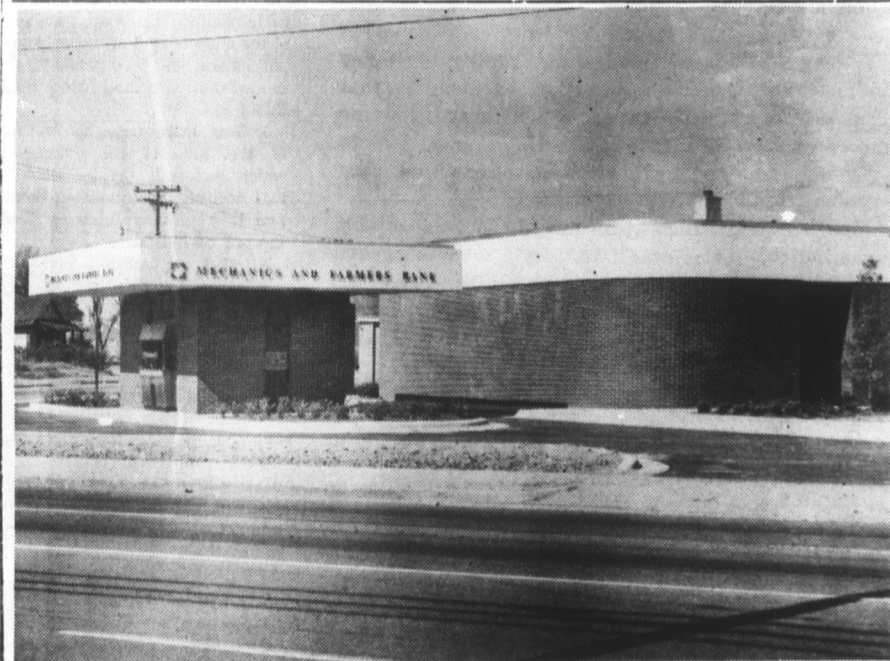
MECHANICS & FARMERS BANK