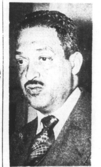
IN NAVAL HOSPITAL — Supreme Court Justice Thurgood Marshall, 61, was admitted to Bethesda Naval Hospital Friday for treatment of an "acute upper respiratory" infection.

A court spokesman said that barring complications, Navy doctors expect Marshall to be out of the hospital in about a week. The court met Monday after a two-week recess.