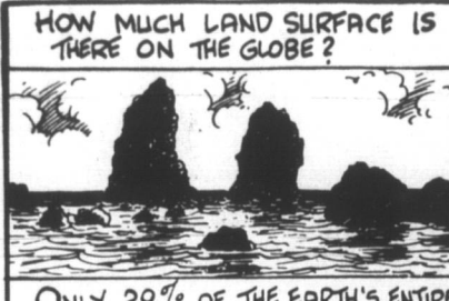
ONLY 29% OF THE EARTH'S ENTIRE CRUST PROJECTS ABOVE THE OCEANS, THAT COVER ALL THE REST OF THE PLANETARY SURFACE!