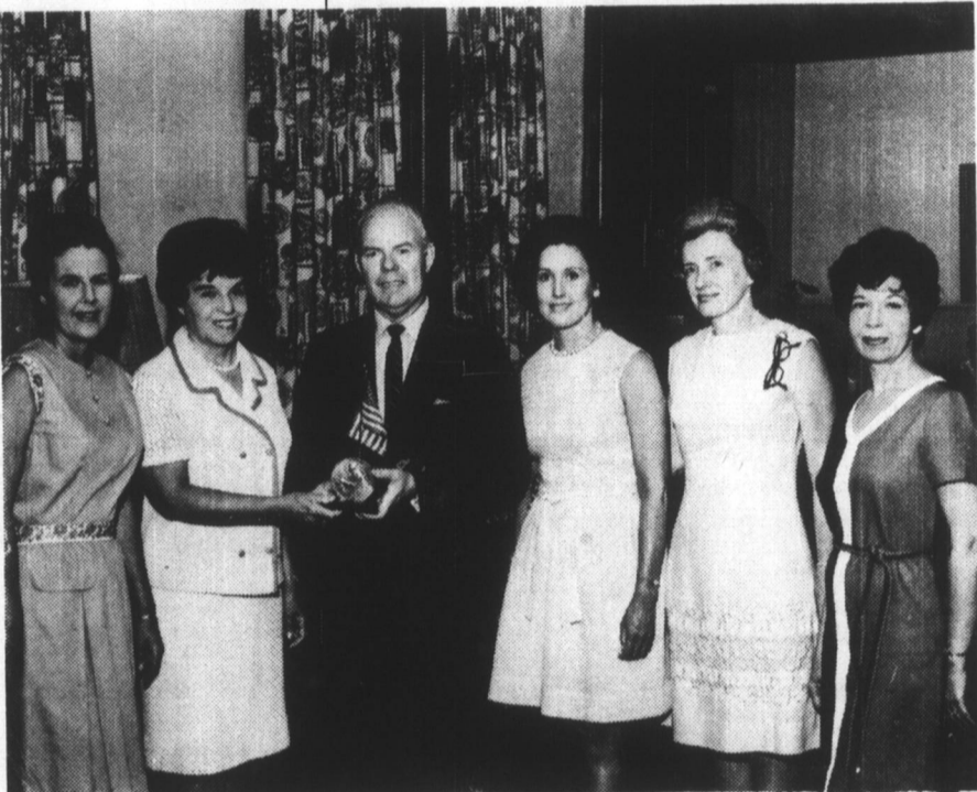
GETS HONOR AWARD —Monday evening, June 8, at the Central YWCA the Women-in-Action for the Prevention of Violence and Its Causes receives the National George Washington Honor Medal of the Freedoms Foundation of Valley