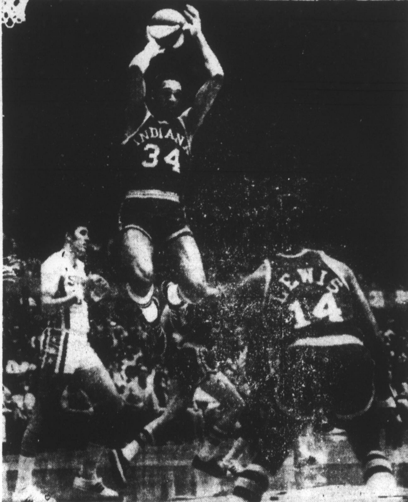
A Pacer Hauls In One Of 27 Rebounds