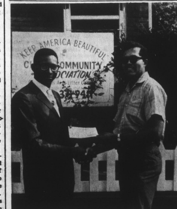
AIDS COMMUNITY CLEAN-UP PROJECTS — Two community clean-up projects in the Home-wood-Brushton section of Pittsburgh (Pa.) were awarded incentive grants of $500 each by the

A very highly sensitized afternoon of Gospel Musical Entertainment is scheduled for Sunday afternoon Sept. 27, 1970 at Mt. Zion Baptist Church, Fayetteville Street at 2:30 p.m. with the combined efforts of the Community Baptist Mixed Chorus and the very popular (non-recording) Mt. Zion Gospel Chorus along with