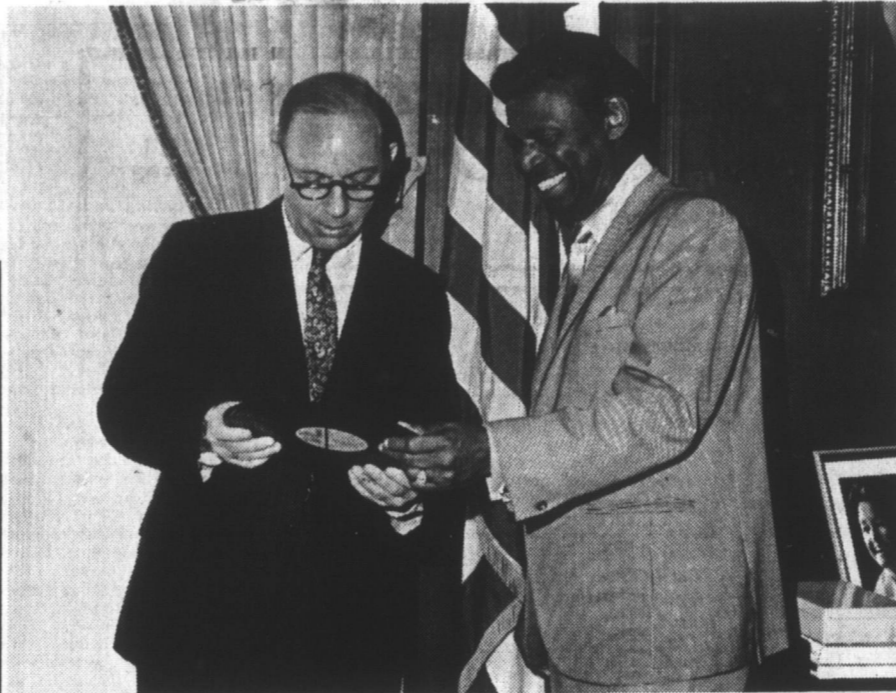
CUTTING DISCS FOR YOUTH Earl "Fatha" Hines, right, world-famous jazz pianist, and Secretary of Labor J. D. Hodgson talk over the value of recordings made by entertainment artists urging young people to continue their education. "Fatha" Hines is cutting a record to support the annual

64 Buick Wildcat 2-door hardtop. White finish, power steering, power brakes, auto. transmission, whitewall tires $695