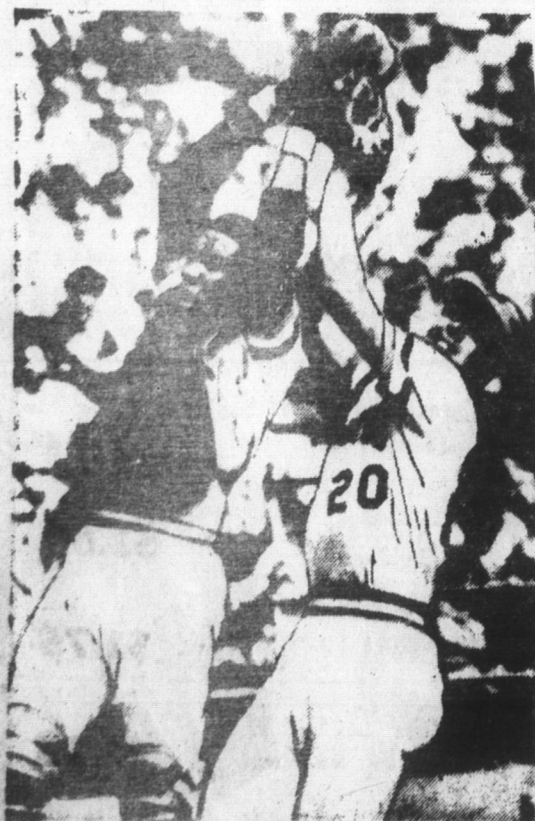
Collision As Pirates Bow

In the game, Federal City College was making its varsity debut on the collegiate scene after being ranked as the number four club team in the nation following its 6-0 record last year.