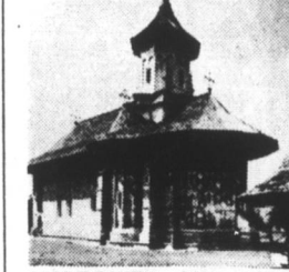
MOLDOVITA Monastery in Romania. A colorful, 20-foot high fresco on its South wall depicts the Tree of Jesse which traces Christ's ancestry.

Romania—though neighbor to Slavic countries on three sides—is Latin; its people descending from the Romans who occupied this land almost 2,000 years ago. And, as an outpost of Latin culture set in the East, Romania's heritage can be discovered in its magnificent "painted churches."