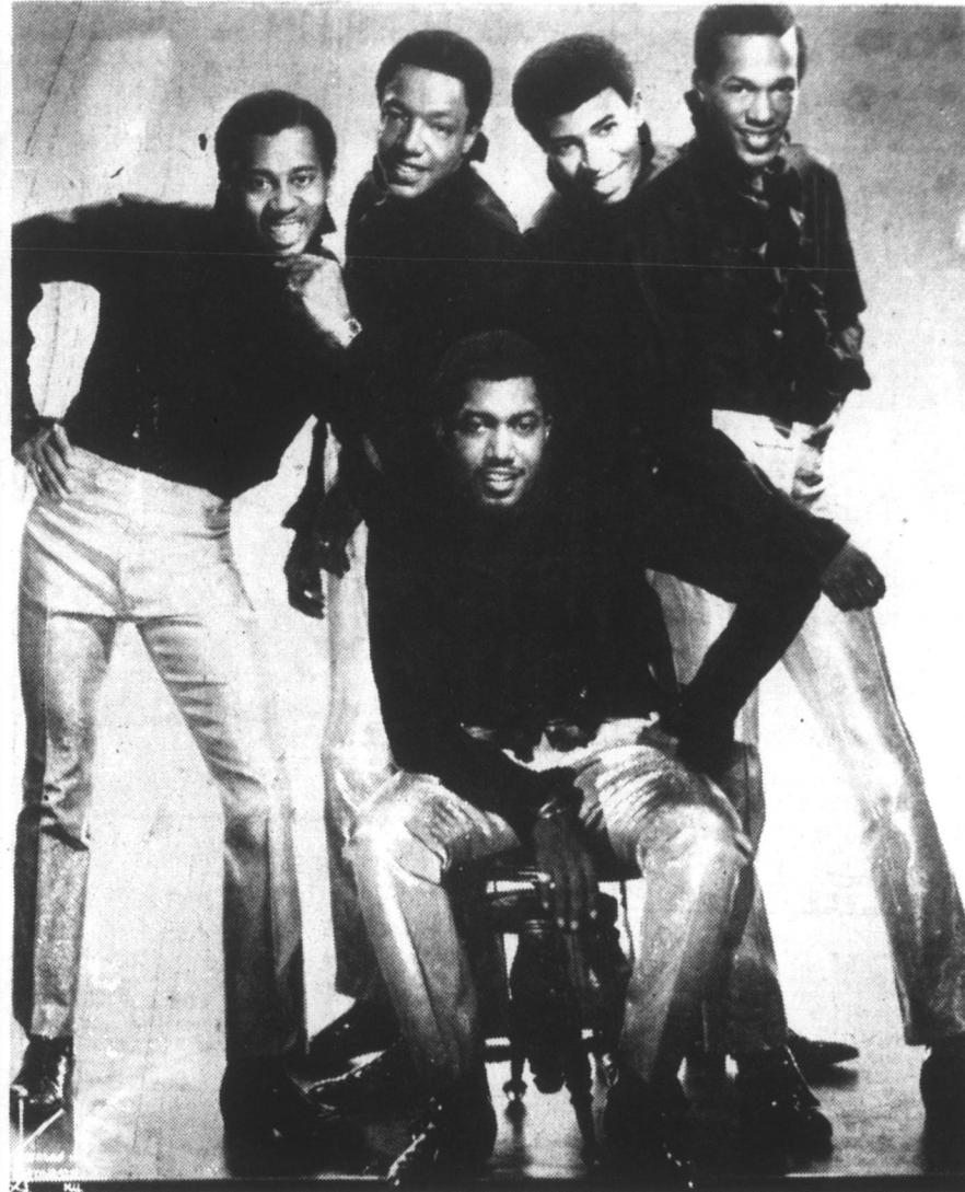
HEALINE ARRAY OF STARS—The Temptations, one of the top vocal groups on the music scene, headline the array of stars appearing on The Ed Sullivan Show over the CBS-TV Network on Sunday, January 31, 8:00-9:00 P.M. (EST). Also joining the show are singer Connie Stevens, the comedy

In order to Hayti to be reborn, for Black people in Dur-