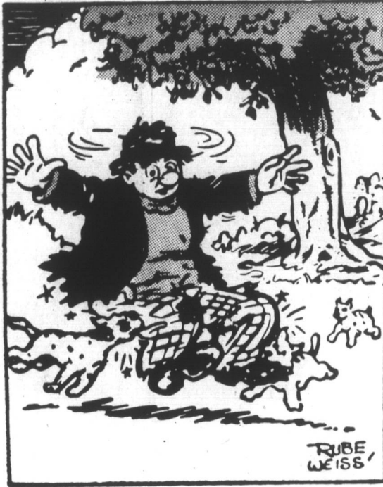
Men are blamed for sticking their nose into things; but it is the only way a dog tracts out hiz game.