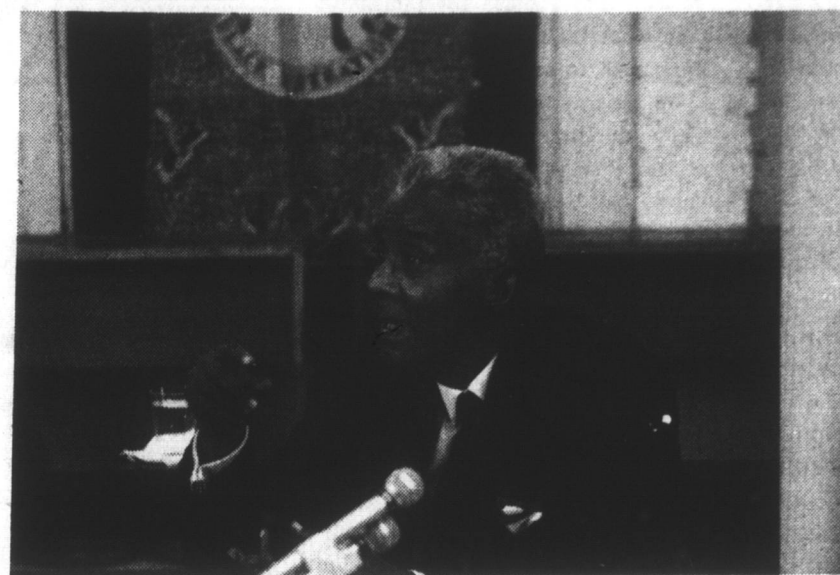
C. L. R. JAMES