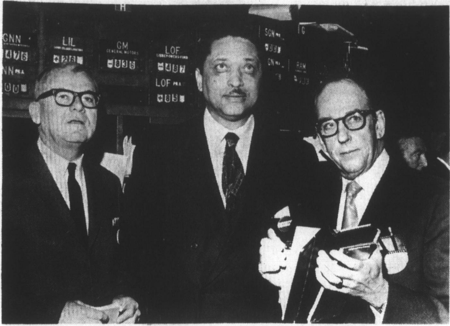
CHECKING OUT STOCK MARKET —Dr. Leon Sullivan (center), president of Opportunities Industrialization Centers, recently took 30 of his business interns and graduates to Wall Street to see and learn the operations of the New York Stock Exchange. Here Dr. Sullivan is on the floor of the stock exchange