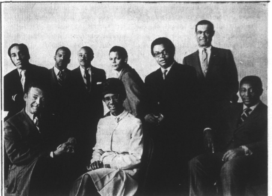
MEMBERS OF ADVISORY BOARD OF BLACK ENTERPRISE — They represent a broad cross section of Black Americans of proven abilities. Seated left to right are: The Honorable Edward Brooke, Senator from Massachusetts; The Honorable Shirley Chisholm, Representative from New York; The Honorable Chas. Evers, Mayor, Fayette, Mississippi. Standing: Earl G. Graves, Publisher and President of Earl G. Graves Associates, Con-

Local firms participating in the JOBS consortium are as follows: Black Industries (telephone linemen), North Carolina Blue Cross and Blue Shield (clerk typists), Duke Knitting Mills (link knitting operators), United Durham, (See ESTABLISHES 10A)