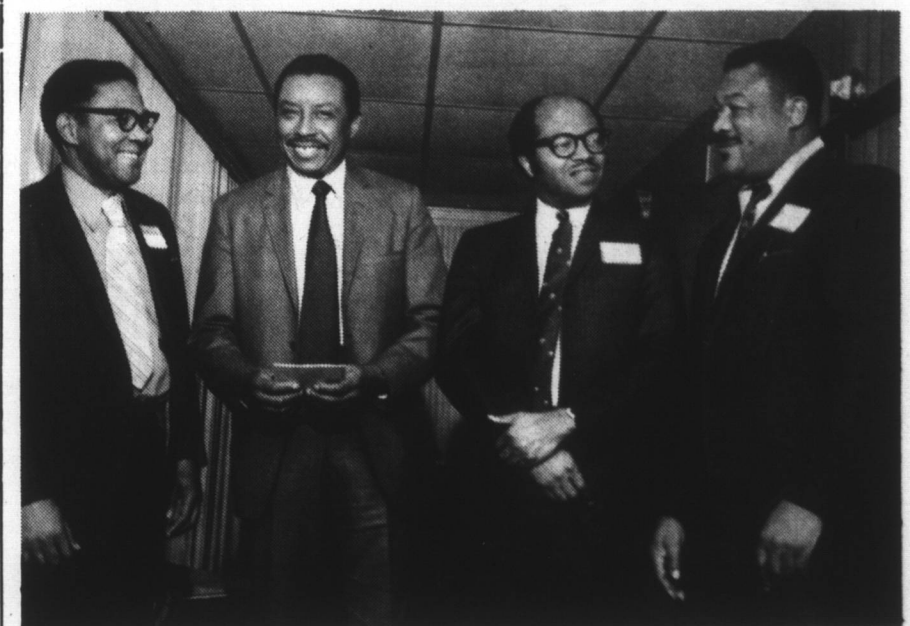
BUSINESS LEAGUE SEMINAR PRINCIPALS — Fayetteville Business League's one-day Business Seminar held Friday at the Utopia Lounge, attracted more than 175 participants. The highlight of the session was a luncheon speech by Attorney Floyd McKissick (second from left). With Attorney McKissick are other