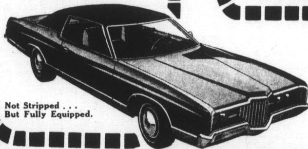
Not Stripped . . . But Fully Equipped.

Take your pick of an LTD 4-DOOR SEDAN or 2-DOOR HARDTOP (Air Conditioned)