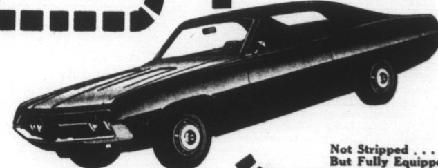
Not Stripped . . . But Fully Equipped.

Take your pick of an TORINO 2-DOOR HARDTOP 4-Door Sedan (Air Conditioned)