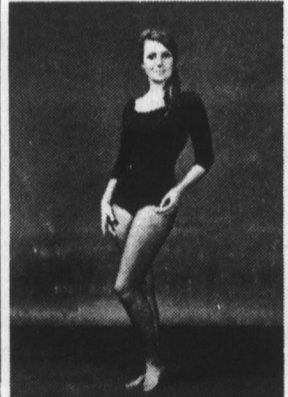
No matter how pretty the girl, a direct front view is not flattering.