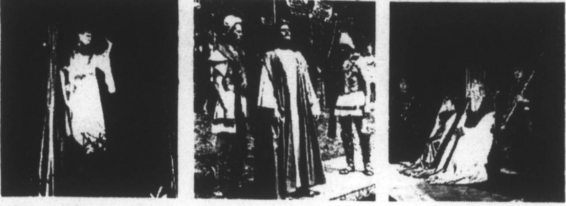
When a rebellious son mocks the faith of his parents, he is confronted by an Angel of the Lord (left), is stricken, then miraculously healed. The Pageant (center), depicts Christ's ministry to his people in the Holy Land, then his arrest by Roman soldiers and his martyrdom. King and Queen Mosiah (right). The king casts aside his royal powers and establishes a constitutional republic.

malcontents moves away into the wilderness, slips into savagery with barbarous rites and levels. This is one of the more bizarre scenes in the performance. As the years pass, two factions of the civilization fight a war of extermination. Perhaps the most exciting scene in the whole Pageant is the destruction of the City of Zarahemla by earthquake, lightning, conflagration—a punishment for the wickedness of its inhabitants. Only the righteous are spared.