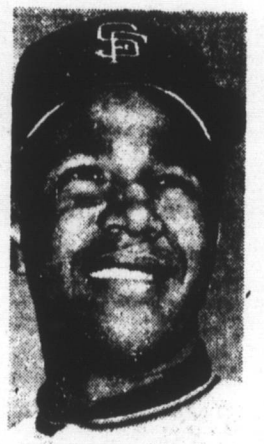
JUAN MARICHAL ... center of storm ...