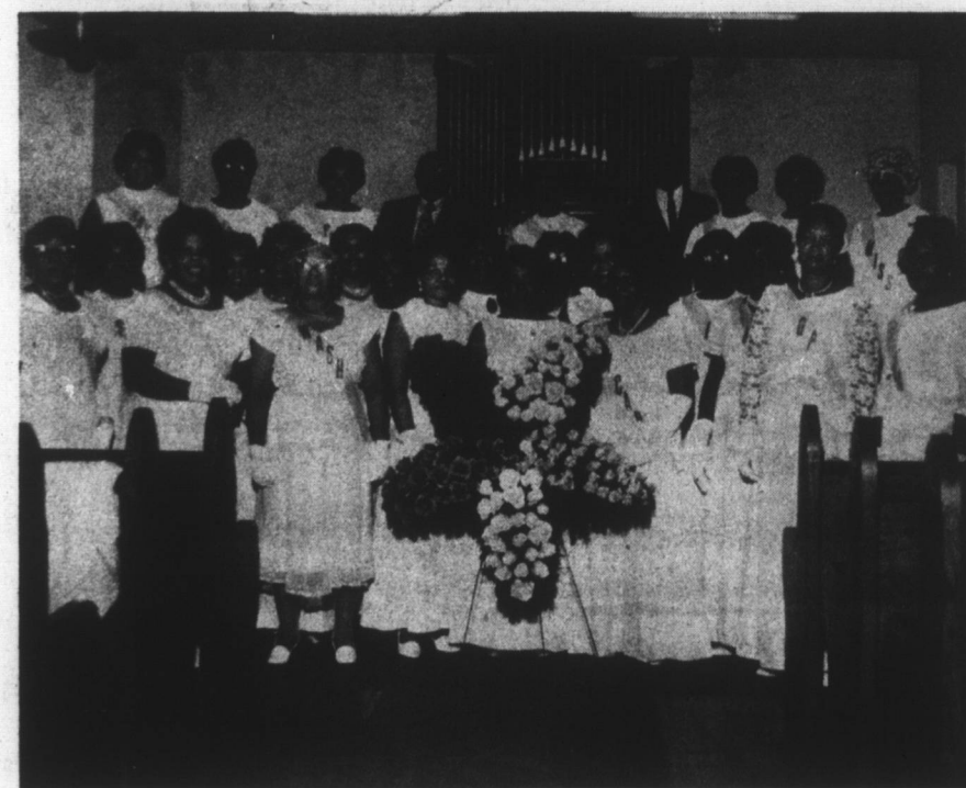
PROSPECT No. 379